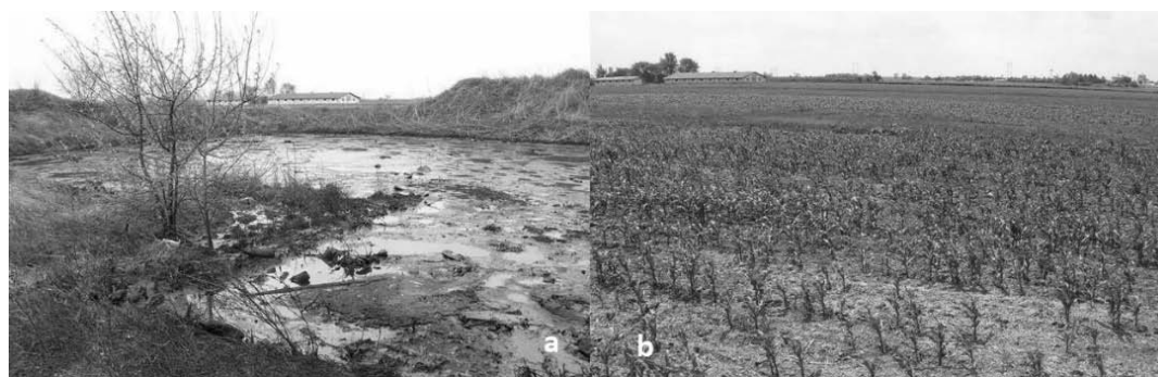
Figure 3. The field during initial monitoring (a) and 180 days after the application of microorganisms (b)

Figure 3. shows how the field looked before (a) and after (b) the bioremediation process. The bioremediation process had a significant impact on the environment and aquatic ecosystem. It can be observed that the barren field was transformed into fertile land. Our further research will focus on the possibility of applying a similar bioremediation system to the soil polluted with microplastics.