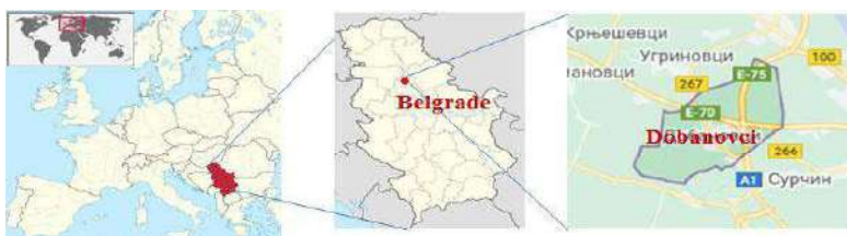
Figure 1. Geographical position of Dobanovci

In this study, ex-situ bioremediation was performed on the soil from different areas in Serbia contaminated with waste oils from petroleum products. The ex-situ bioremediation process was performed at the BREM plant in Dobanovci (N 44°48'52.42" E 20°13'13.08"), Figure 1.