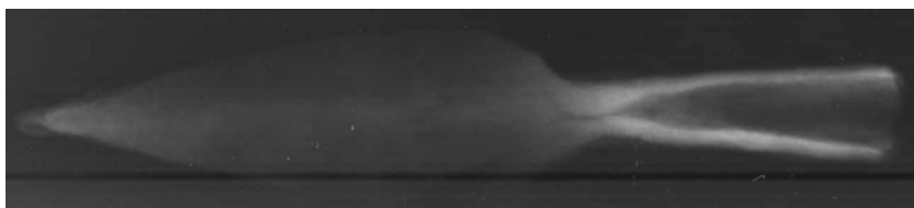
Fig. 2. Radiograph of the archaeological artefact-spearhead.

Figure 2 shows the archaeological object (spearhead) recorded by the radiographic method. The brighter areas on the radiographs indicate thicker parts of the artefact. It can be seen that the base metal (iron) is slightly damaged by the corrosion process. At the narrow part of the spearhead, a longitudinal crack can be seen, probably due to mechanical damage of the artefact. Additional internal defects in the material were not observed on the radiograph. The spearhead is generally in a well-maintained condition.