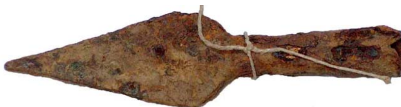
Fig. 1. Photographic image of the archaeological artefact-spearhead

From the photographic image of the archaeological artefact shown in figure 1, it can be seen that the artefact (spearhead) is covered with a thick layer of corrosion products (rust), characteristic for iron. The length of the artefact is 14cm, and the width is 3.5cm. The top of the spearhead is in a shape of a leaf and a socket for planting.