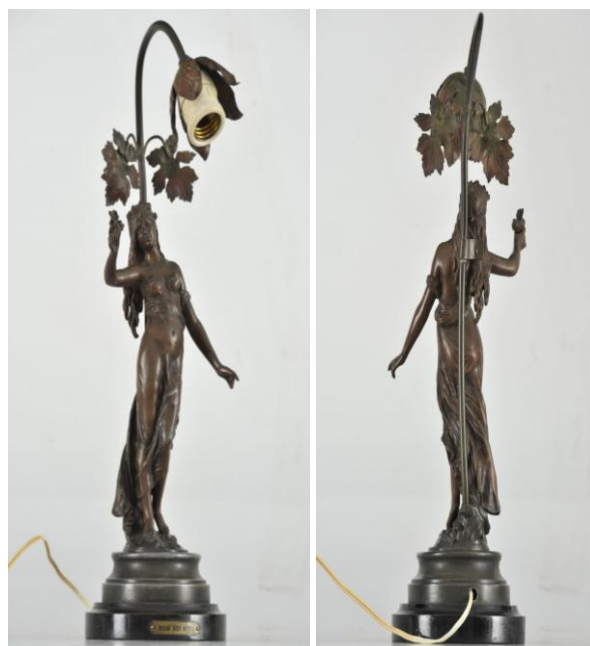
Figure 1. Two views of lamp statue before the arm is broken

The table lamp, however, has a common function, without a kind of heavy loading or simmilar service conditions, but to its owner this lamp has a particular impotrnce from the origin, it is dated from the end of XIX century, as the property of his family. The entire appearance of this lamp, registered before damaging, is shown in Fig. 1, at two views. The body of the lamp is produced by casting, after that is polished. The surface of this lamp is fully decorative protected. brown color originated from a thin copper coating. In the moment of deposition the coating, either it is provided in chemical or electrochemical process,the color might be adjusted by proper chemical contest of used electrolytes.