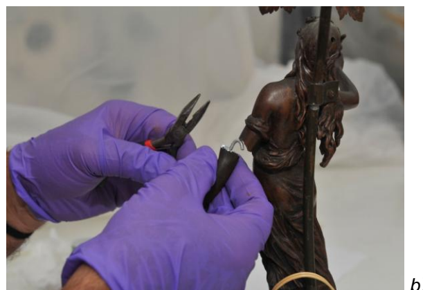
Figure 4. Preparing for reinforcing with aluminum wire