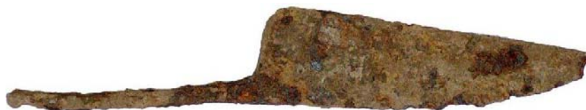
Figure 1. Photographic image of the archaeological artefact (Museum Šabac).

From photographic image of the archaeological artefact shown in Figure 1, it can be seen that the artefact (knife) is covered with thick layer of corrosion products (rust), characteristic for iron. Length of the artefact is 23.5 cm, and width 3.5 cm. The artefact have flat blade, with blunted part that ends with squared grip.