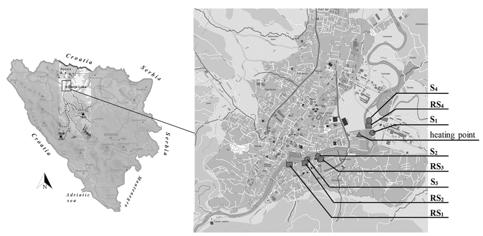
Fig. S-1. Flow of the Vrbas River with the sampling locations of the river sediments, RS_1-RS_4 , and the riverbank sediments (soils), S_1-S_4 .