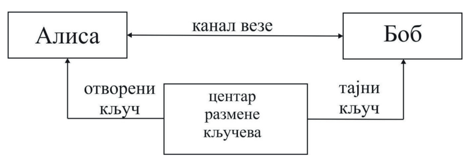
Figure 2. Structure of asymmetric cryptosystems<sup>5</sup>

Asymmetric cryptosystems use two keys — Figure 2. The first key is public and is available to all users of the information exchange. Information is encrypted with this key. Only the recipient (Bob) has the second secret key. Decrypting information with the public key is impossible. Also, the decryption key cannot be determined by using public key encryption ( \mbox{Румянцев} & \mbox{Голуб-чиков} , 2009).