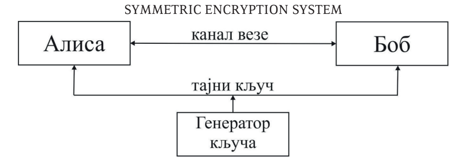
Figure 1. Structure of symmetric cryptosystems<sup>4</sup>

The primary task of cryptography is to transform an initial text (plaintext) into an arbitrary string of characters called a cryptogram. The number of characters in the plaintext and the cryptogram may differ. The secrecy of the encryption algorithm itself cannot, in principle, ensure the unconditional security of the cryptograms, as it is assumed that Eva (the enemy) has infinitely large computer resources. Therefore, public key algorithms are used nowadays. The security of modern cryptosystems is based on the secrecy of a small item of information called a key, rather than on the secrecy of an algorithm. The key is used to manage the encryption process and should be easily changeable at any time. At the end of the nineteenth century, the Dutch scientist Kirchhoff formulated a rule by which the security of a key is ensured if the entire encryption system, other than the secret key, that is, the information that manages the process of cryptographic transformation, becomes known to the enemy, (Kilin, Horosko & Nizovcev, 2007).