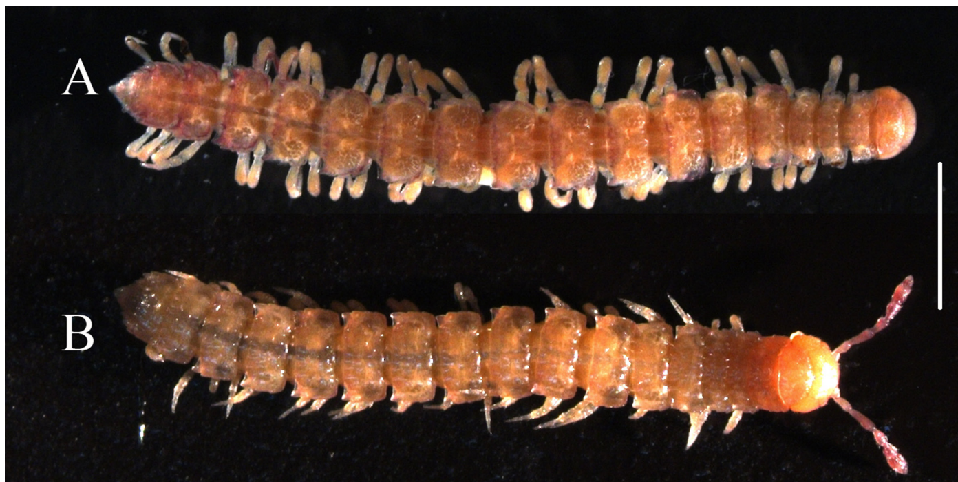
Fig. 3. Brachydesmus troglobius Daday, 1889 from the Lazareva Pećina Cave, village Zlot, near Bor, East Serbia. A – male, B – female. Scale line = 2 mm.

n -alkanes which were injected after the sample under the same chromatographic conditions. The search was performed against our own library containing 4,951 spectra, and the commercially available Adams, NIST05 and Willey07 libraries containing more than 500,000 spectra.