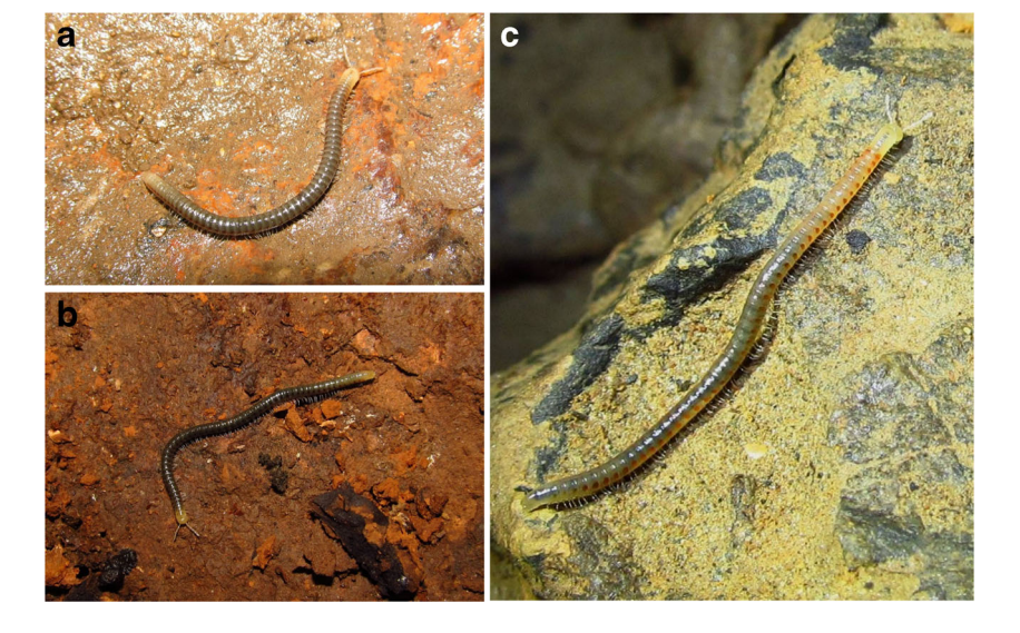
Fig. 1 a Typhloiulus serborum Ćurčić et al. 2005, Devojačka Pećina Cave, vill. Podgorac, near Boljevac, East Serbia (photo D. Antić). b Serboiulus deelemani Strasser 1971, Vetrena Dupka Cave, v. Vlasi, Pirot, South Serbia (photo D. Antić). c Lamellotyphlus sotirovi Makarov et al. 2002, Buronov Ponor Cave, v. Golubinje, Miroč Mt., East Serbia (photo D. Antić). Defensive glands are visible

Genetic Analyses After extraction of defensive secretions, individuals were transferred into 99% ethanol and subsequently used for the genetic analyses. Two to five segments from the middle part of the bodies were dissected for DNA extraction by DNeasy Blood & Tissue Kit (Qiagen, Hilden, Germany). Primers used for the mitochondrial 16S rRNA gene were LR-J-12961 (Cognato and Vogler 2001) and LR-N-13398 (Simon et al. 1994) (Biomers, Ulm, Germany), and for the nuclear 28S rRNA gene, SH-28 and SL-28 (Muraji and Tachikawa 2000). We obtained 28S rDNA sequences for all species except for T. serborum. PCR amplifications were performed with annealing temperatures ranging from 45 °C - 55 °C using BioTherm<sup>TM</sup> Taq DNA Polymerase and 1.5 mM MgCl<sub>2</sub> buffer. PCR purification was done with ExoSAP-IT (VWR, Langenfeld, Germany). For T. bureschi the PCR amplification was done with Phusiontaq and 7.5 mM MgCl<sub>2</sub> buffer. PCR products were sequenced with 3.2 µmol amplification primers using the BigDye Terminator v.3.1 Cycle Sequencing Kit (Applied Biosystems, CA, USA) followed by purification of