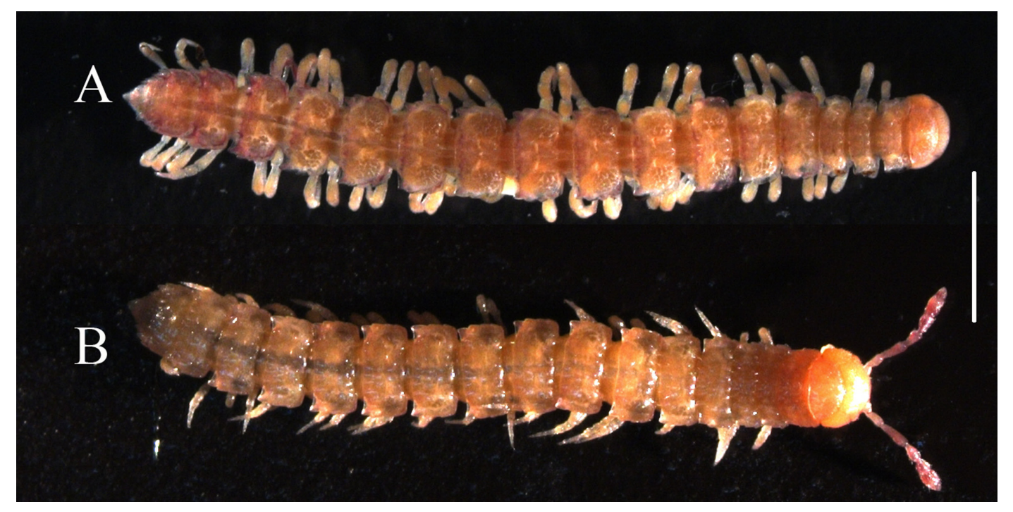
Fig. 3. Brachydesmus troglobius Daday, 1889 from the Lazareva Pećina Cave, village Zlot, near Bor, East Serbia. A – male, B – female. Scale line = 2 mm.

n-alkanes which were injected after the sample under the same chromatographic conditions. The search was performed against our own library containing 4,951 spectra, and the commercially available Adams, NIST05 and Willey07 libraries containing more than 500,000 spectra.